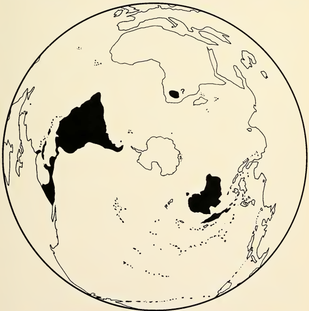
Fig. 11. Distribution of the living members of the family Leptodactylidae.

Primitive living frogs have typical relict distributions with the Ascaphidae in western North America and New Zealand, and the Discoglossidae in Europe, North Africa, eastern Asia and the Philip-